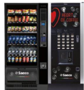
Artico L + Atlante Evo 700