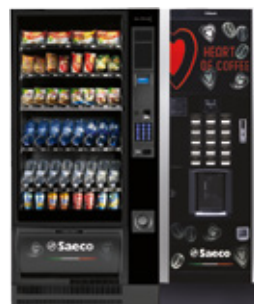
Artico L + Atlante Evo 500