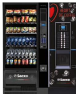
Artico L + Cristallo Evo 600